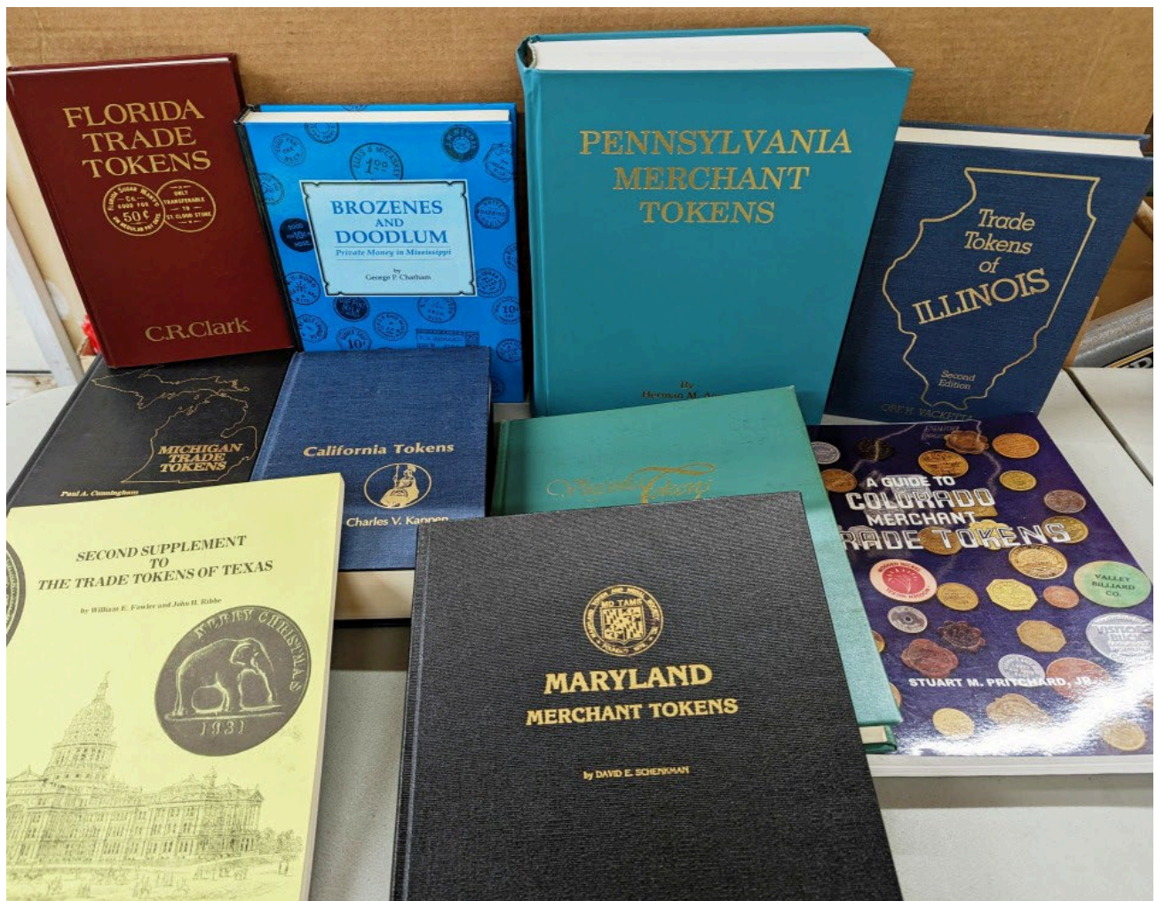
A Selection of States from our AVA Library